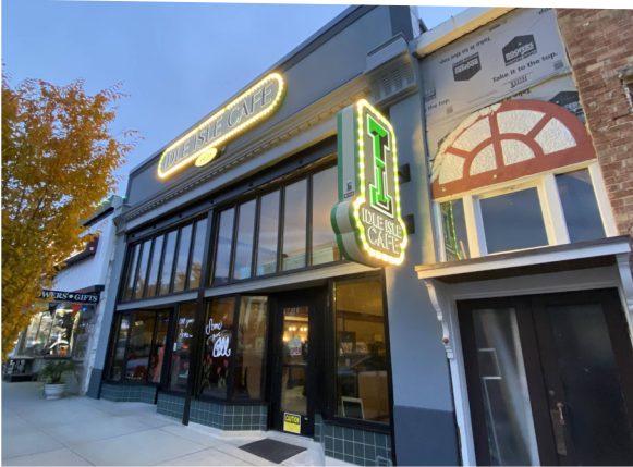
Main Street revitalization, Brigham City, Utah, 2021.

What do people like to do in your town? How and where do you celebrate things that are important to the community?