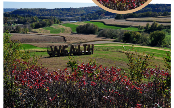
Art installation near Reedsburg, Wisconsin, courtesy Wormfarm Institute.