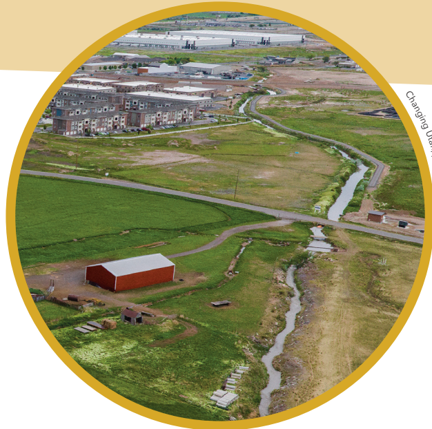
Changing Utah

Do you live in a rural, suburban, or urban place? What communities do you belong to?