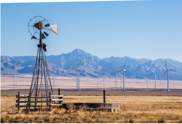
Windmills old and new, Milford, Utah

Now that you have spent time thinking about community, change and rural places throughout this exhibition, what are rural America's best assets? What are the most critical issues rural communities face?