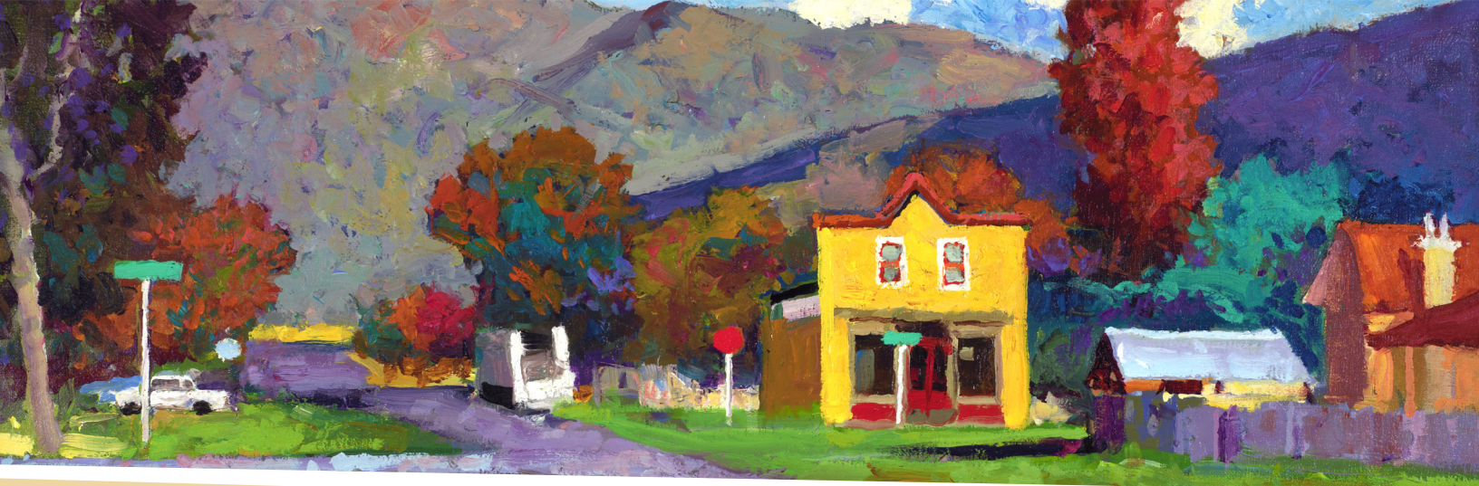
Squirt Store, Spring City, 2019, painting by Randall Lake.