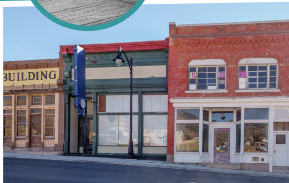
Closed stores in Eureka, Utah, 2017, Heidi Besen/Shutterstock.

A rural crossroads, FreeImages.com/Bettina Schwehn.