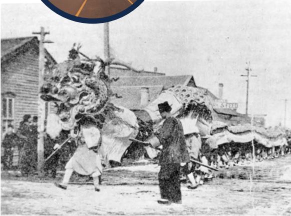
Chinese parade, Utah, c1880, courtesy Utah Historical Society.

Businesses and festivals attract visitors to Telluride, Colorado.