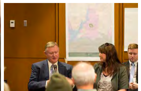
Senator Evan Vickers