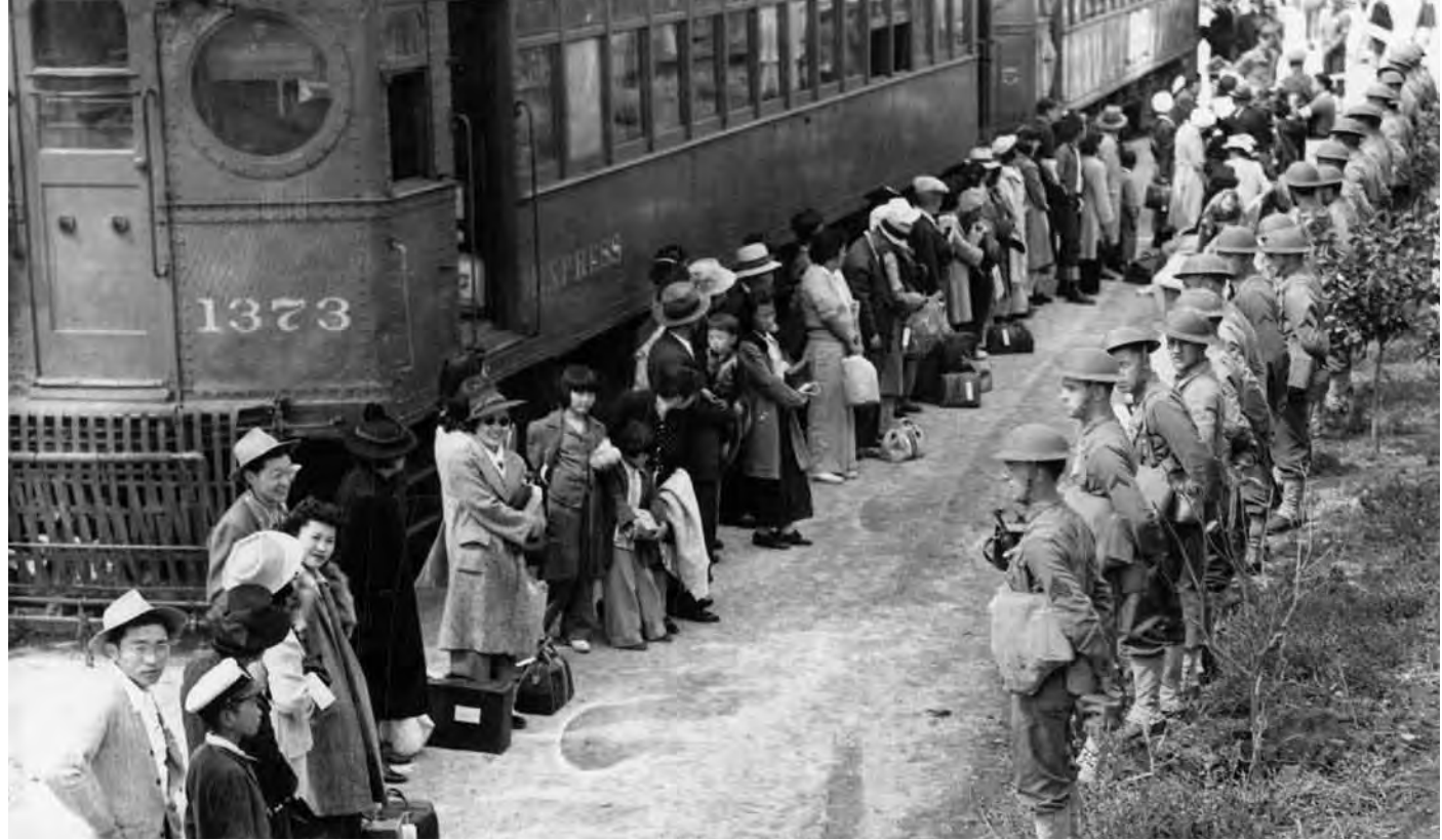
Japanese Americans arrive at Tanforan Race Track in California before relocation to internment camps like the one at Topaz, near Delta, Utah, 1942.

They celebrate the ability to go where they please when they please. But as Journey Stories reminds us, the reality of mobility in American life has been far more complex. While some Americans enjoyed complete autonomy in their movements, others faced circumstances that impelled their journeys. Still others had no choice at all. The experiences of Africans wrenched from their homes and transported across the Atlantic into slavery or of American Indian Nations removed from their homelands illustrate that un-free migrations have been an all too common part of our National story. By looking at who traveled and exploring their various motivations, we can better understand the human sorrows and joys of Utah's Journey Stories.