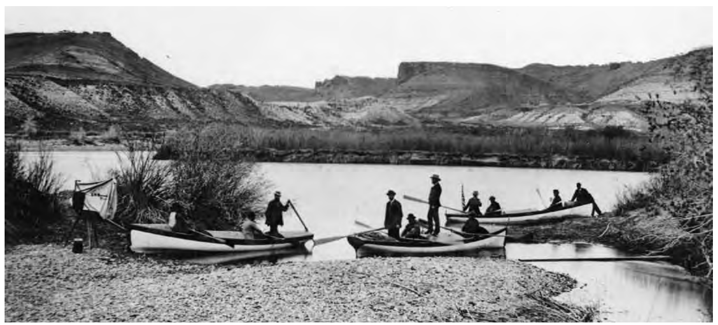
Second Powell Expedition putting in on the Green River, 1871, photo by E.O. Beaman, Utah State Historical Society,

flyaway embers from causing wild fires. The No. 119 on the other hand had a heavier firebox and burned coal that produced far fewer sparks. The UP turned to coal both out of necessity (the meager supply of wood on the Great Plains) and opportunity (the opening of coal mines along its route). Thus the No.119 embodied the transition from a reliance on organic energy sources such as wood to our modern dependence on fossil fuels.