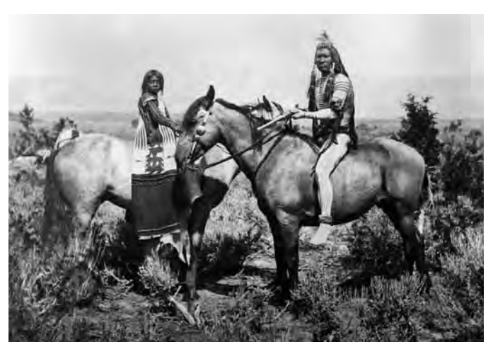
Ute Indians, Uinta Valley, Utah, c. 1873

ow one travels is always to some extent a story of technology. In the seventeenth century, for example, lacksquare horses were a new technology that revolutionized travel in Utah. It might seem odd to think of a living creature as technology, but consider what was necessary to care for and effectively utilize horses as well as how the animals transformed Native life. Horses first evolved in North America but were extinct on their native continent by the end of the Pleistocene. They were first domesticated on the steppes of western Asia perhaps four thousand years ago and in time many peoples adapted horses into their lifeways. When the Spanish brought horses back to the Americas at the beginning of the sixteenth century they also brought with them an elaborate equestrian culture that became the basis for much of Native American horse culture as well as modern "Western" style riding. Native peoples first acquired horses in small numbers from Indians who had lived among the Spanish and learned how to breed