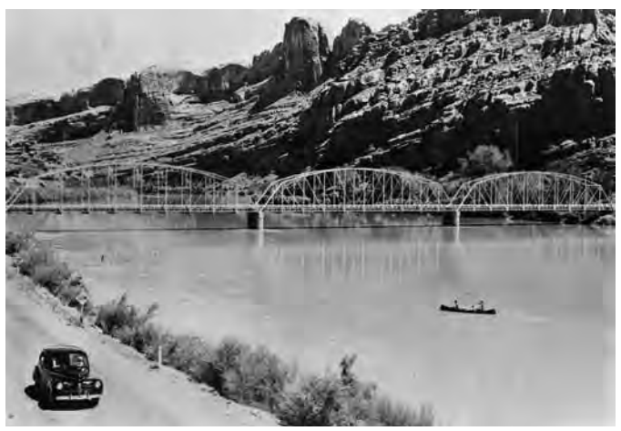
The bridge crossing the Colorado River at Moab follows the same route as the historic Spanish Trail.

I tah's ruggedly beautiful landscape draws millions of tourists to the state each year, but it has also posed major obstacles to travel. In the distant past Native peoples pioneered the most forgiving paths through the jumbled landforms and arid deserts. As a consequence, these Native trails largely defined the journeys made by later travelers. When fur trappers like Jedediah Strong Smith, and government explorers such as John C. Frémont, "blazed" trails they were in reality following paths that had been trod by Native feet for centuries. Indeed, it was often Native peoples themselves who showed intrepid explorers and pioneers the way. While the journey stories of Utah's earliest peoples are not recorded in history, those people must be acknowledged as Utah's true "pathfinders."