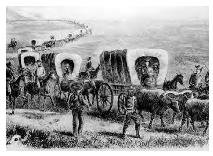
Crossing the Plains - Journeying Zionward.

own language) were living northwest of the Pueblos and became the principal conduit for the horse trade west of the Rockies.