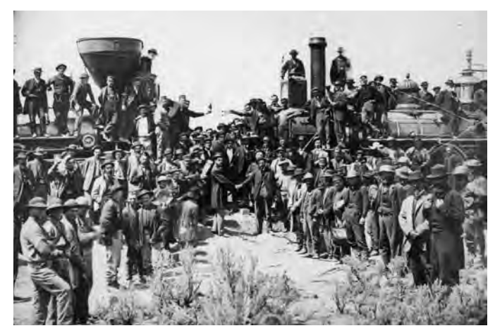
Joining of the transcontinental railroad at Promontory, Utah, 10 May 1869.

The famous photograph of that event illustrates a fundamental transformation in environmental and technological history of the United States. In the image, the Central Pacific's locomotive Jupiter sits nose to nose with the Union Pacific's No. 119. By today's standards the engines were small and primitive. At the time they represented a century and a half of development in steam technology. In most regards they were similar machines, yet there is a notable difference. The Jupiter's smokestack is flared and bulbous while the 119's is narrow and straight. The reason was not aesthetic but related to the fuel each engine burned. Coming from the west the CP relied upon wood cut from the Sierra Nevada and the ranges of the Great Basin. As a result, the Jupiter's stack contained spark arrestors to prevent