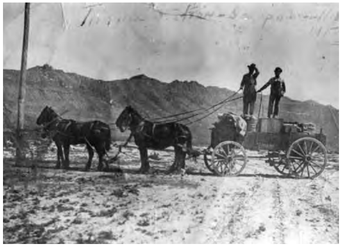
losepa residents picking up goods at a train station, 16 miles north of the settlement, c. 1910.

survey party reported that the Uinta Basin was "one vast contiguity of waste, and measurably valueless, except for nomadic purposes, hunting grounds for Indians and to hold the world together," Brigham Young scrapped plans to send Mormon settlers into the area and instead viewed it as the logical location for a Ute reservation. Shortly thereafter Abraham Lincoln created the Uintah Reservation by executive order. Utes had always hunted and traversed the basin but its resources were meager compared to the Utah or Sanpete valleys that sustained the Timpanogos and other Ute bands of central Utah. It was not until the longest and bloodiest of Utah's Indian conflicts, the Black Hawk War, erupted in April of 1865 that time ran out. In June 1865 the Ute bands accepted the provisions of the Treaty of Spanish Fork and began their journey to the basin. A decade and a half later their kinspeople, the White River and Uncompaghre Utes, joined them on what became the Uintah and Ouray Reservation, after being forced from their homes in Colorado.