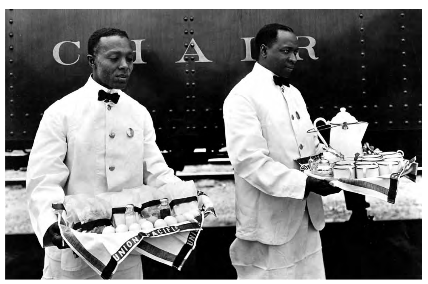
Waiters and porters on the Union Pacific Railroad.

Greek Festival are just some of living legacies of the industrial immigration to Utah.